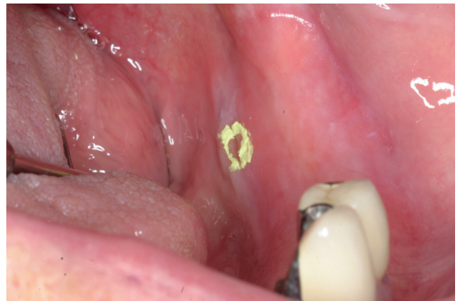
Figure 1. Marked soft tissue irritation in retromylohyoid area with calcium hydroxide paste.