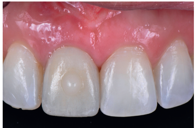
Figure 1. Frontal view of composite resin button on facial surface of implant interim crown.